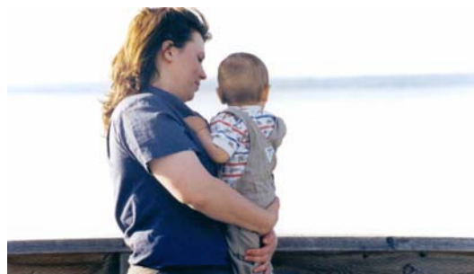
The stewards today work for the stewards of tomorrow

Thank you to all the volunteers who made the project a success.